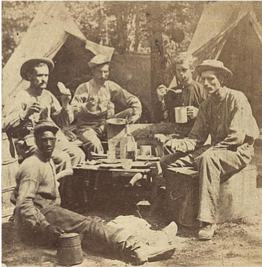
Photograph of a Union soldier camp taken between 1861 and 1865