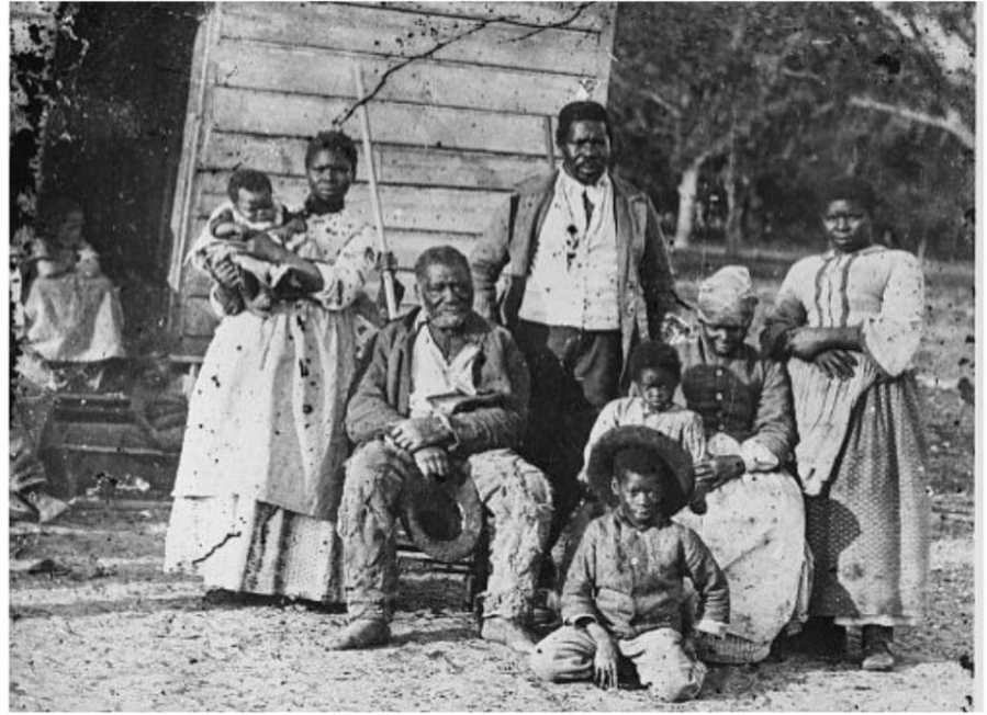
Photograph of an enslaved family in South Carolina taken in 1862