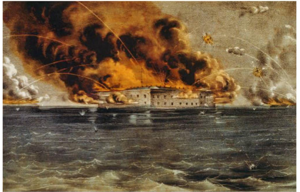
Illustration of the Attack on Fort Sumter from 1861