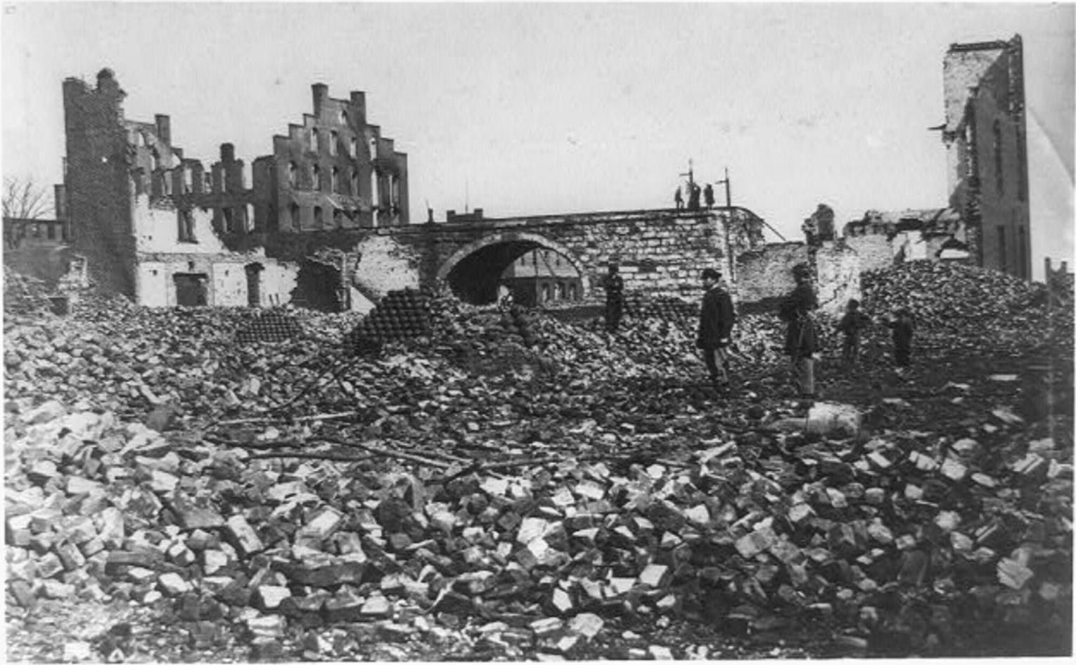
Photograph of ruins in Richmond, Virginia, taken in 1865